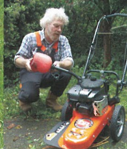
SMOOTH OPERATOR: The DR Professional 825 trimmer /mower is lightweight and easy to wield in tight spaces